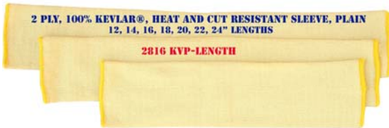
2 PLY, 100% KEVLAR®, HEAT AND CUT RESISTANT SLEEVE, PLAIN 12, 14, 16, 18, 20, 22, 24" LENGTHS 2816 KVP-LENGTH