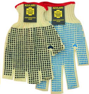
7 GAUGE, MEDIUM WEIGHT, DOT 2 SIDES 4815 SMALL AND LARGE ONLY