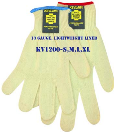
13 GAUGE, LIGHTWEIGHT LINER KV1200-S,M,L,XL