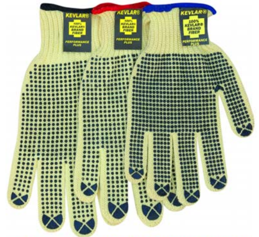
7 GAUGE, MEDIUM WEIGHT DOTS 1 OR 2 SIDES 2 SIDE DOT: 4815 S, M, L 1 SIDE DOT: 4816 S, M, L