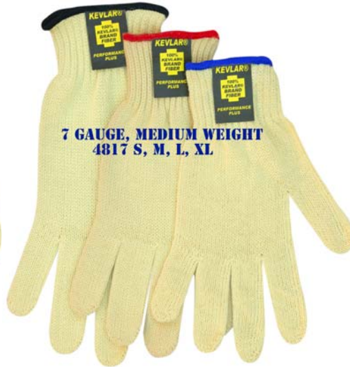
7 GAUGE, MEDIUM WEIGHT 4817 S, M, L, XL